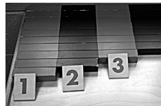
Red and Blue rods & Numeral Association

Here are the names of the materials from last month's article: